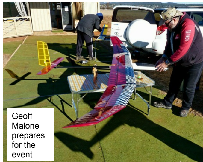
Geoff Malone prepares for the event

Discussion with flyers indicated they are happy with the rules we are using, we may also have another host club in 2019, which will allow for a forth round.