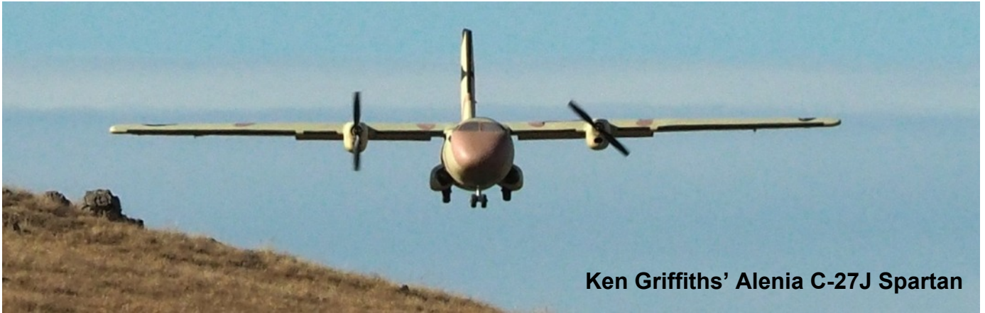
Ken Griffiths' Alenia C-27J Spartan

The RAAF has recently taken delivery of its tenth Alenia C-27J Spartan. These aircraft were made in Italy, but protection and electronic equipment was fitted by L3 in Waco, Texas. Described as a battlefield airlifter, the Spartan can be landed in small fields and may be used for medical evacuations, air drops etc.