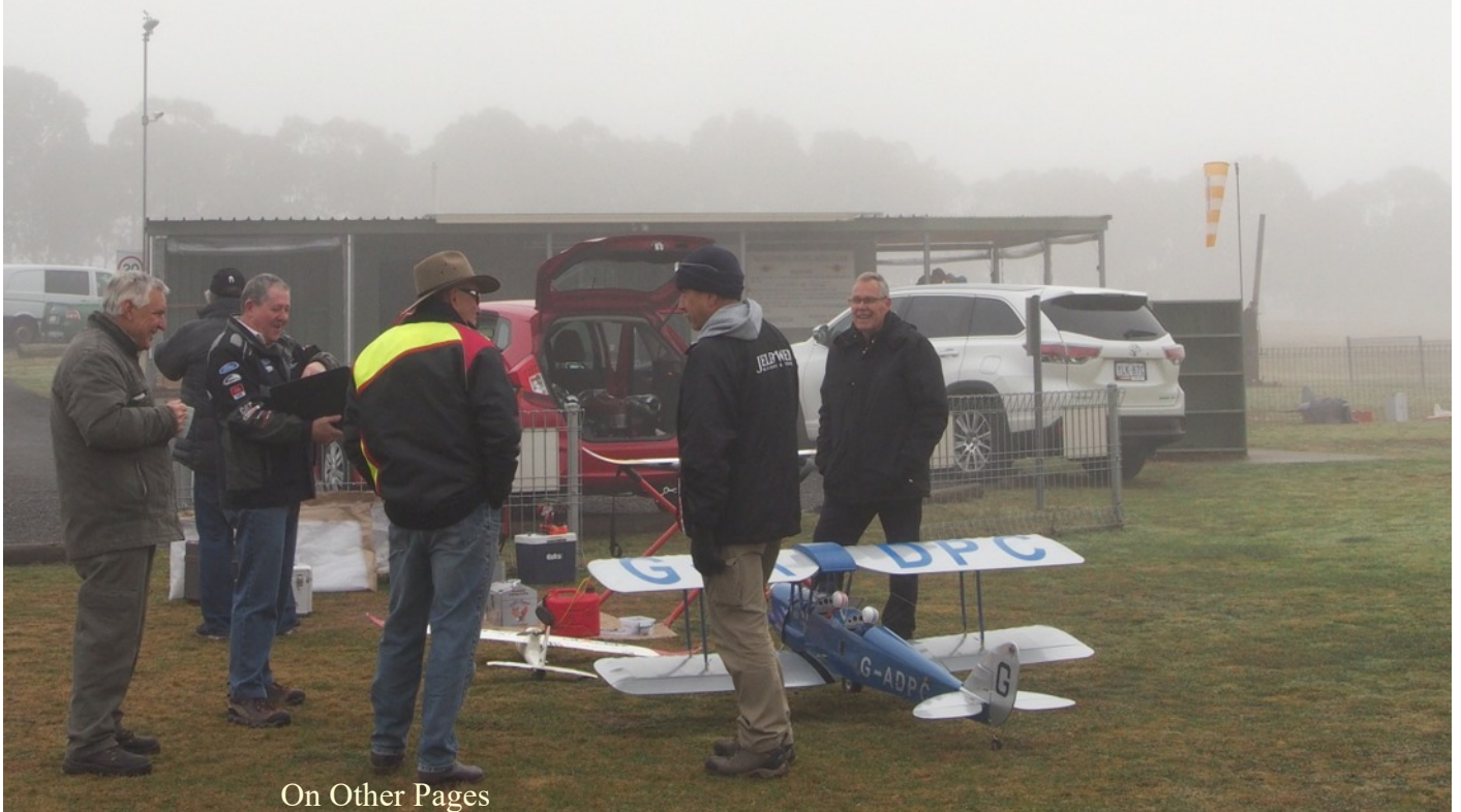
Photo shows the field on 1 August, the foggy morning when Model of the Month (page 4) was maiden.